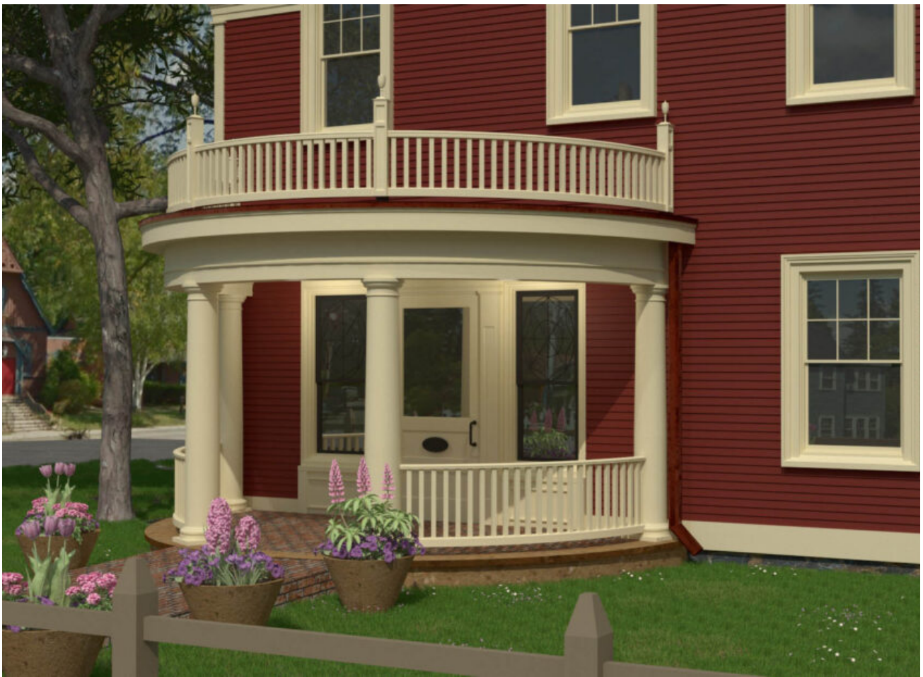
An architectural rendering of the portico Historic Saranac Lake plans to rebuild on the Trudeau Building.

Mallach said the town is providing a $25,000 match toward the roof project to make up the rest of the costs. This has already been budgeted for in this year's budget, she said.